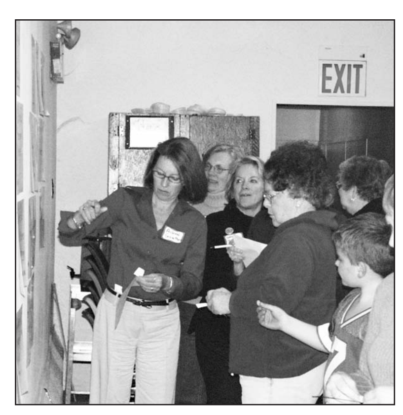
Assemblywoman Aileen Gunther, left, helps prioritize issues with valley residents in a set of meetings held throughout the valley in 2004.

survey of key issues was taken during a series of evening meetings and prioritized at a subsequent series of meetings. The following issues were chosen at top priorities.